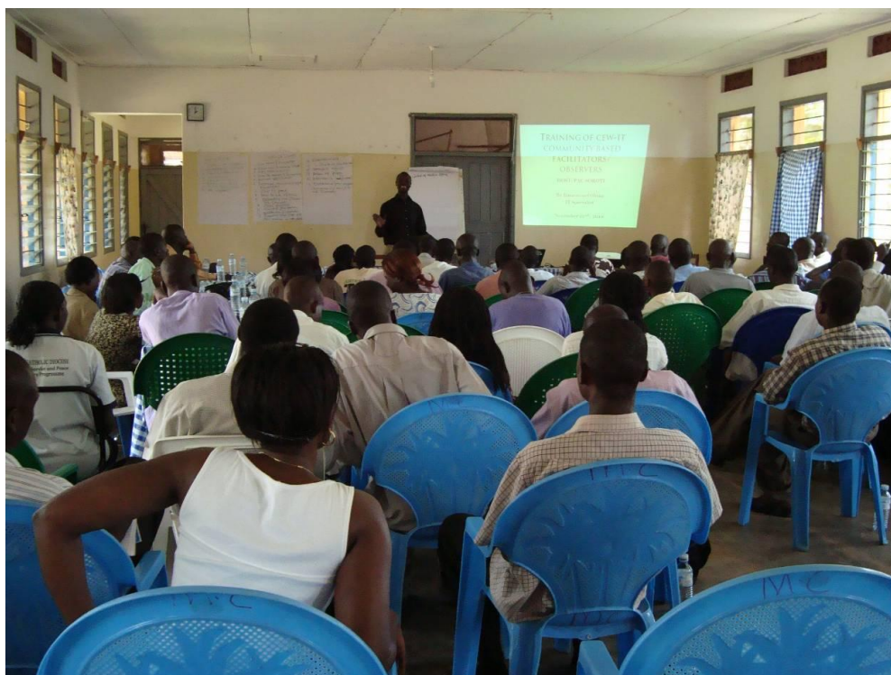
TRAINING OF ELECTION REPORTING INCIDENTS BY SMS