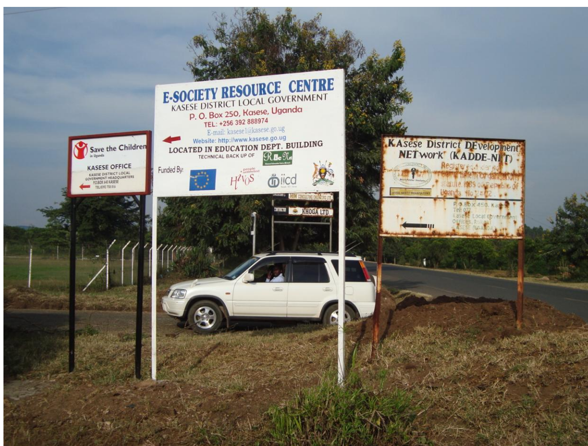
Sign post at Kasese showing the direction of e-society centre

Case “For activities to be implemented in 2010 it has to be noted that the activities on project level initially planned to be realized together with RIC-NET did not take place. The question arises here how KRC plans to compensate or adapt the project plan. Are a number of planned activities just cancelled?” By Petra Stammen and Moses Kisembo pg 31.