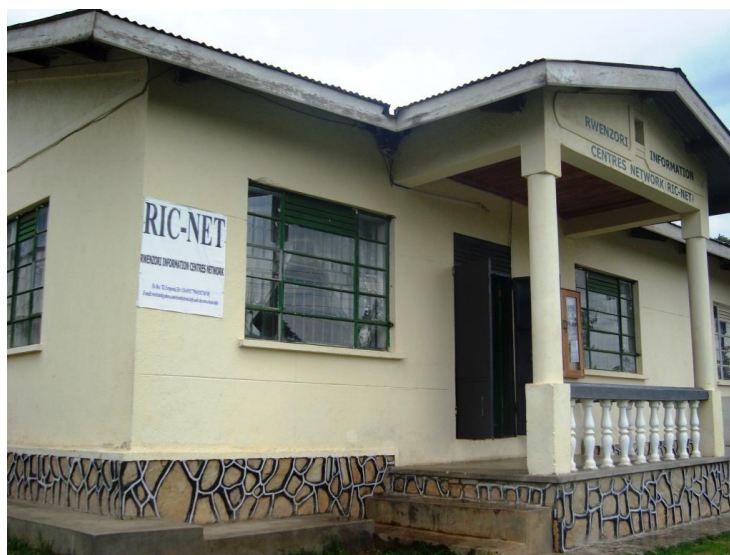
RIC-NET OFFICE ON plot 18 Mugurusi Road Fort Portal

RIC-NET offices are located on plot 18 Mugurusi Road, Fort Port Municipality after SATNET offices. The photo for our location is below.