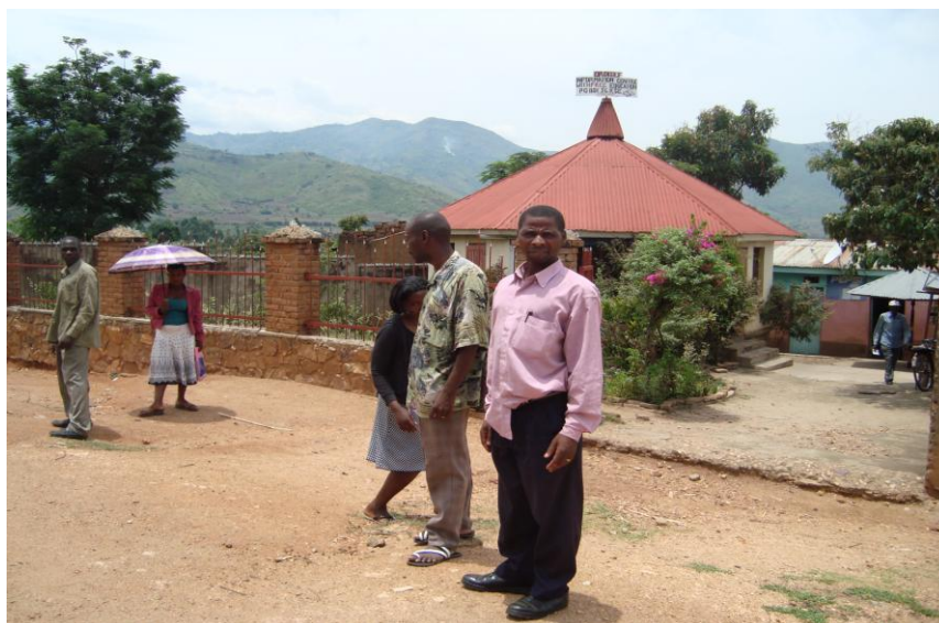
BUSONGOARA RURAL INFORMATION CNENTRE (BRIC)

RIC-NET operates primarily in the seven Districts of Rwenzori Region; Kabarole, Kyenjojo, Kamwenge, Kasese, Kyegegwa, Ntoroko and Bundibugyo Districts in Western Uganda. The leverage of RIC-NET projects is now country wide. Though RIC-NET is a network of other centres/CSO; it has become members to several Networks and consortiums to ensure that its expertise is put to the service of a wide community. This vision of operating in the whole of Uganda through partnership with other local CSOs ,local government leads to shared results of RIC-NET's efforts and up scaling of the impact to other regions unlike Rwenzori region only before.